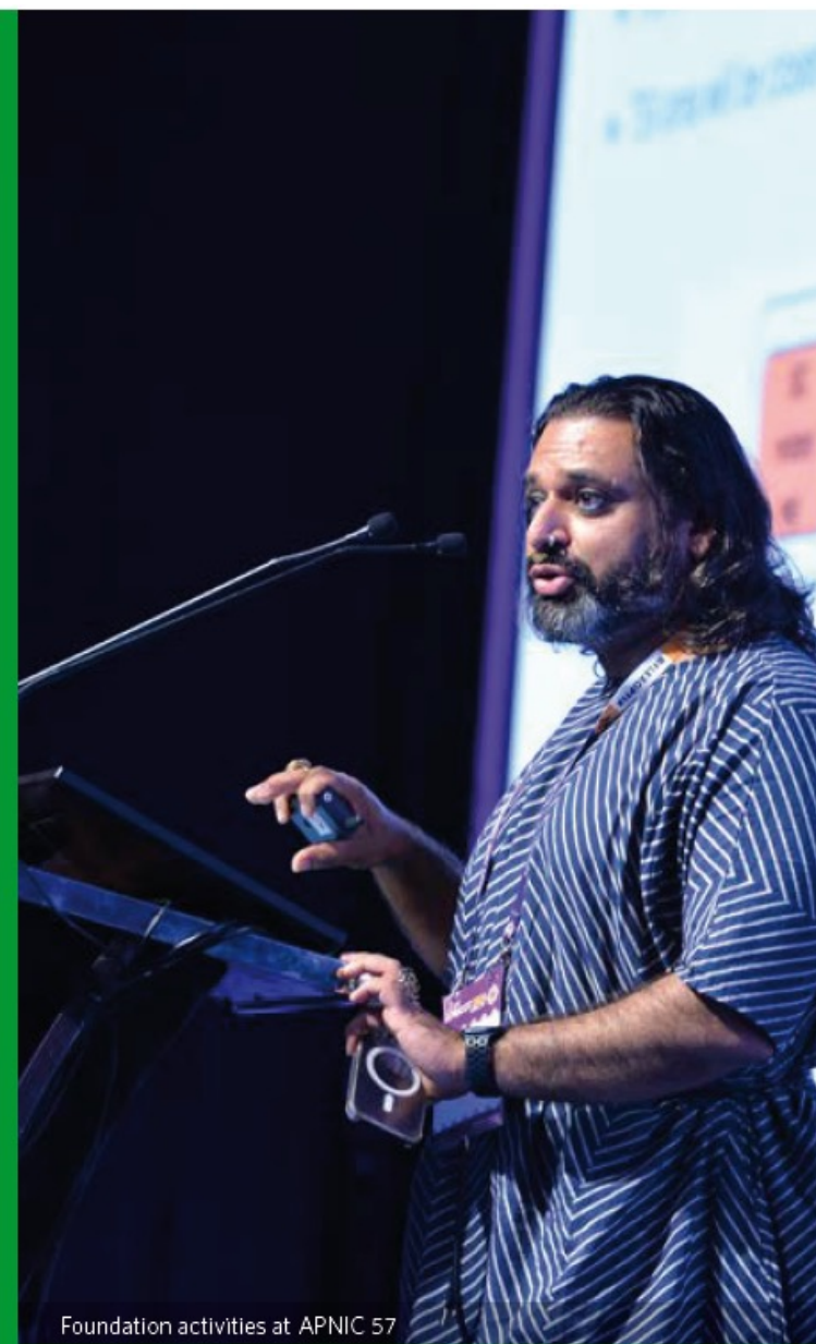
Foundation activities at APNIC 57

16 FOUNDATION COMMUNITY ASSISTANCE INITIATIVES