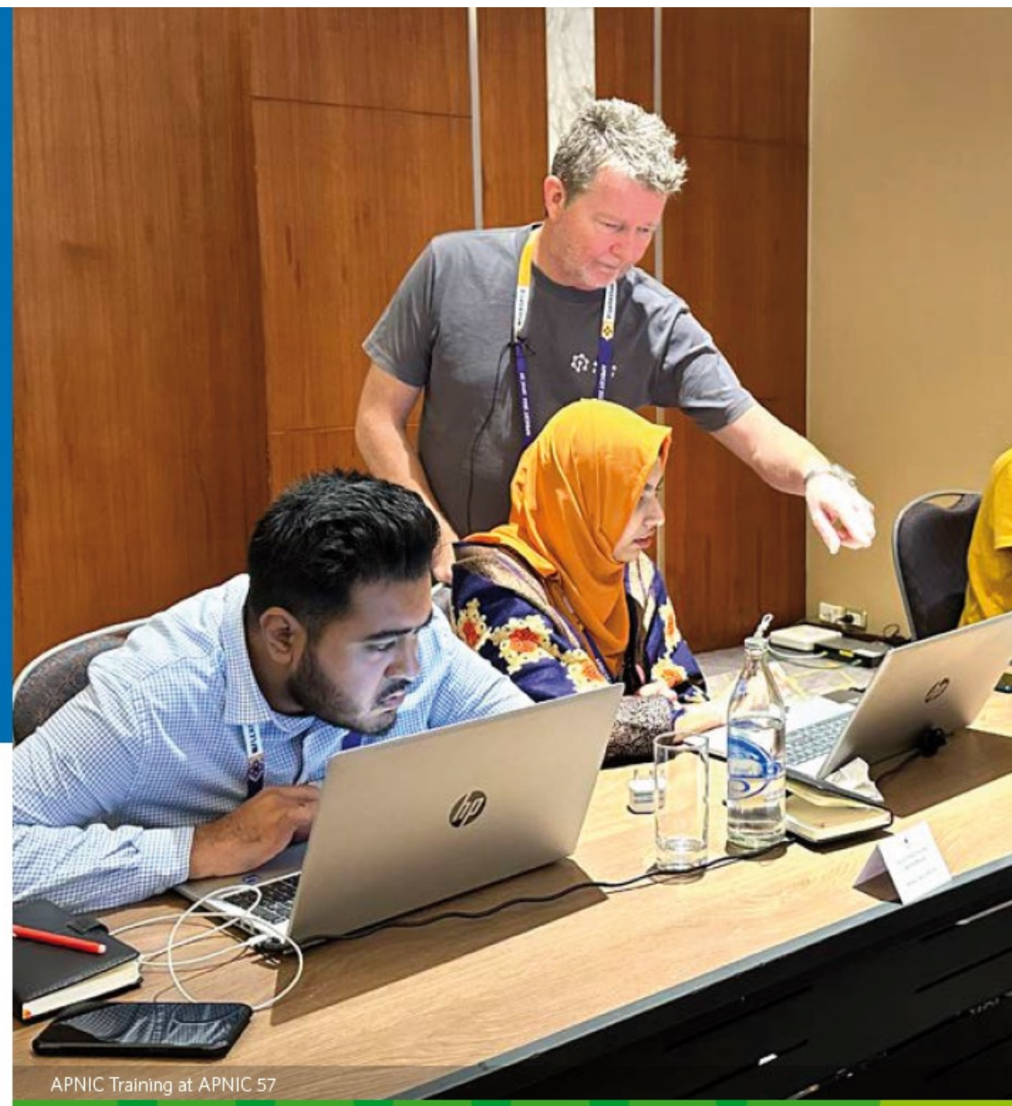
APNIC Training at APNIC 57